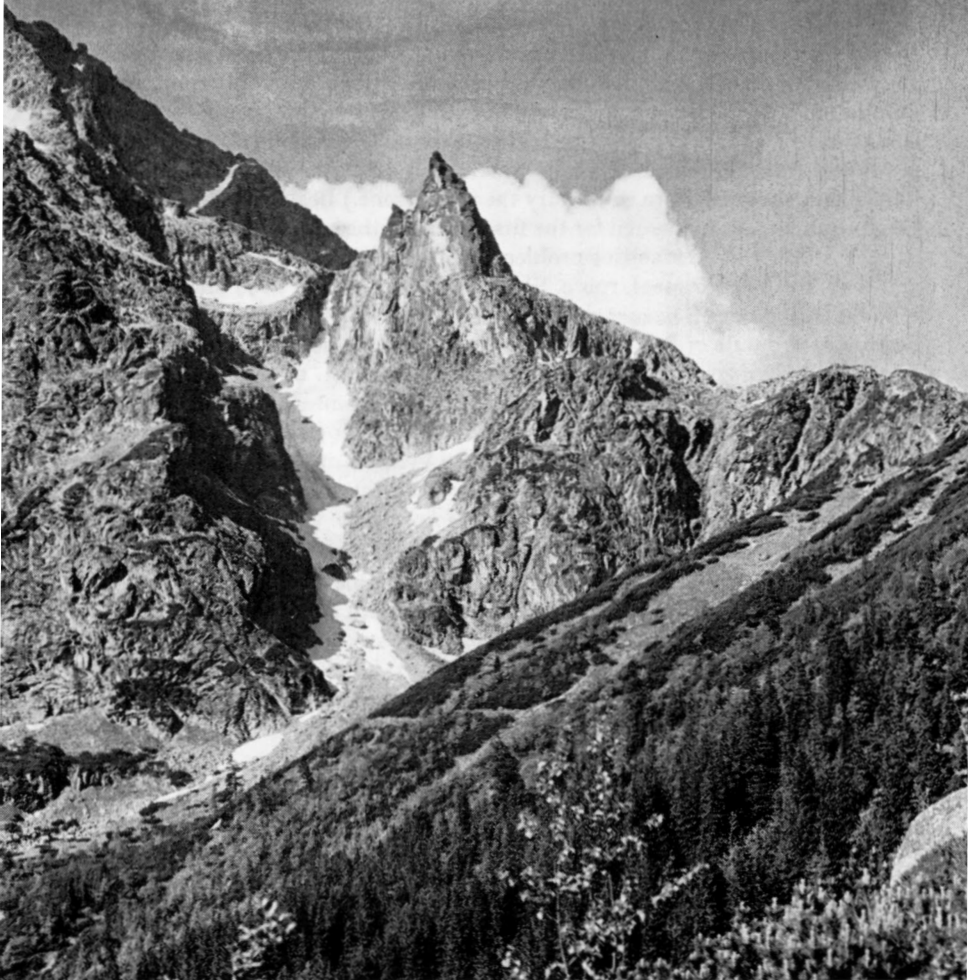
65 Cubryna and the Mnich